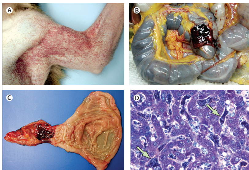
Figure 3: Haemorrhagic manifestations noted in non-human primates infected with Ebola virus Petechiae on the arm and axillary region of a Cynomolgus monkey infected with Sudan Ebola virus (A). Also shown are haemorrhages in the ileum (B) and a gastroduodenal lesion (C) from a Cynomolgus monkey infected with Sudan Ebola virus and fibrin thrombi (arrows) in sinusoids of a rhesus monkey infected with Zaire Ebola virus (D).

Ebola haemorrhagic fever presents as a viral prodrome with a high potential for differential diagnosis, especially early in outbreaks. The initial diagnosis of this syndrome is based on clinical assessment. Therefore, proper contingency plans should be developed. Several imported cases of the closely related Marburg virus have been